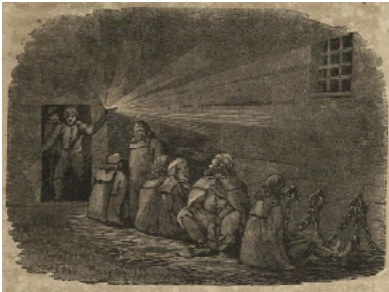
Figure 2. A Hungarian prison (drawing by Richard Bright. In: BRIGHT, Richard: Travels from Vienna through Lower Hungary with some remarks on the state of Vienna during the Congress, in the year 1814 . Edinburgh, Archibald Constable and Company, 1818, 425.)

In summary, the travel report of Bright provides a cornucopia of information about crime and punishment in early 19 th century Hungary and England, at a time when, despite differing levels of societal development and law systems, penal systems of the two countries bore significant similarities.